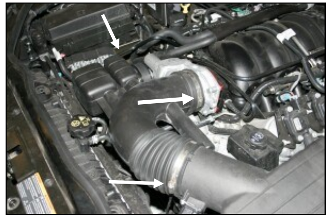
6. Reinstall the intake tube, tighten the two hose clamps, and reconnect the crankcase breather tube. Reinstall the beauty cover, and oil cap in the reverse order that they were removed. Re-connect the negative battery cable!